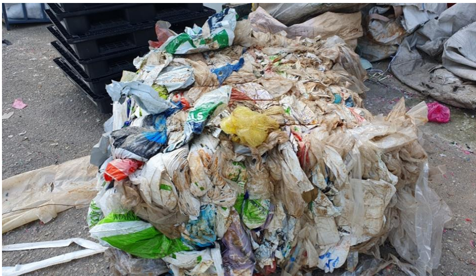
Imported Contaminated Plastic Waste Bale in Malaysia