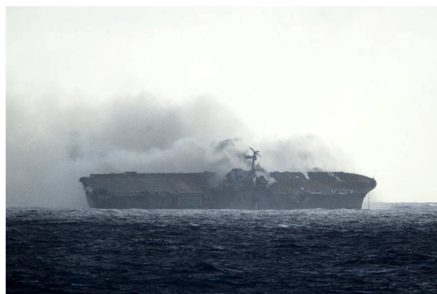
The Ex- NEW ORLEANS was sunk via SINKEX during summer 2010, along with four other vessels: the Ex- ANCHORAGE, Ex-MONTICELLO, Ex-ACADIA and Ex-SATURN. These five vessels contributed an estimated 47,521 tons of recyclable material, worth an estimated $29 million, to the depths of the sea, forfeiting approximately 1,692 jobs from the economy at large while unemployment rates remained steady at 9.5%.

towing cost estimate of $750,000, 75 and the Navy incurred costs of approximately $1,665,548. Taking into consideration the Ex-MONTICELLO's sister ships, the Ex-PLYMOUTH ROCK and Ex-FORT SNELLING, which were each sold to Peck Recycling of Richmond Virginia for recycling in 1995 for a positive cash flow of $268,707 each, the sinking of the MONTICELLO was done so at a surprising financial loss. In view of the fact that these exercises can take place with alternative means as described at the outset, these few examples show where SINKEX is clearly not providing a best value solution to the government, yet the Navy continues to mask the true costs of this ship disposal program in order to continue business as usual.