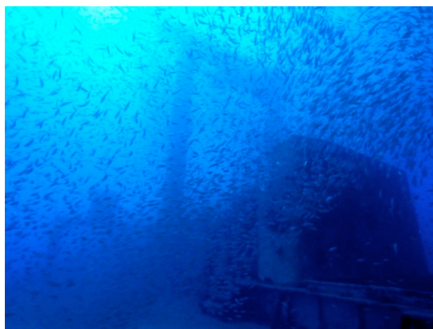
The Ex-Vandenberg was sunk in the Florida Keys National Marine Sanctuary in 2009 at a cost of $8.6 million. The vessel is a popular fishing destination as it is said to attract fish away from the protection of natural coral reefs within the marine sanctuary itself. However, it is well known that fish aggregation at a marked site can exacerbate the problem of overfishing, as concentrated fish populations can be easily and more rapidly harvested.

A similar example exists in New Jersey. In 1970, prior to extensive artificial reef developments in New Jersey waters, only 3% of private fishing trips were on artificial reefs. In 1991, New Jersey began an aggressive campaign to sink material to create a reef network of 1,300 reef sites. By 2000, private fishing trips to artificial reefs increased to 90% of all fishing trips. 106 With 90% of all private fishing trips directed at artificial reefs sites, and artificial reefs making up less than 1% (currently .3%) of New Jersey's ocean floor, the benefits of fish aggregation for harvest are clear. However, the economic benefits to the fishing industry by attracting fish to these marked sites (where even commercial