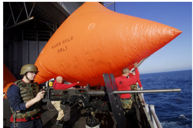
The Navy is using inflatable and biodegradable balloons called killer tomatoes , as low cost targets for gunnery exercises during RIMPAC 2010. Unlike sunken naval vessels, biodegradable balloons are not known to leach toxic materials into the marine environment.

The recent data from the Ex-ORISKANY sinking shows significant leaching of PCBs into the marine environment and provides the opportunity to revoke the general permit based on a government sponsored biological study.