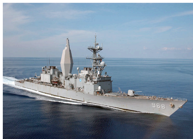
The Ex- ARTHUR RADFORD is now being prepared for sinking as an artificial reef in Summer 2011. The sinking of the RADFORD will discard an estimated $6 million worth of recyclable materials to the depths of the sea, and forfeit approximately 223 jobs, lasting approximately one year, from the economy at large.

Disposing of vessels at sea does not bring best value to the Federal government as costly remediation requirements, combined with a lack of returns from commodity metals (see below), negates any perceived cost advantages including financial contributions from state artificial reefing programs or sports fishery