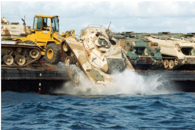
Tanks are pushed off a barge in South Carolina; artificial reefs are the justified ocean disposal purpose.

Secondly, the very notion of ecological enhancement, as claimed by artificial reef advocates, is contradiction in terms unless a case can be made that the human activities in question return damaged environments back to their natural former state. Nature and the environment are considered absolute states – a