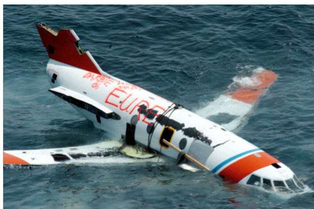
Two U.S Coast Guard HU-25 Falcon jets were sunk off the coast of North Carolina as artificial reefs.

The EPA and its Science Advisory Board accepted the Navy's conclusions that the risks associated with sinking the vessel were negligible and that the sinking would result in a material value to sports fisheries. On this basis, the EPA issued the risk-based disposal permit for the sinking of the PCB contaminated vessel. However, the environmental implications of such a decision are still yet to be fully realized, but future remediation costs are probable.