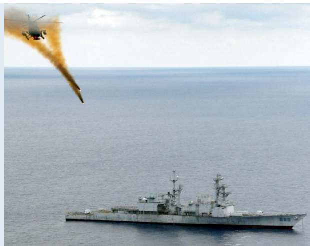
Image at Right: Ex-USS CONOLLY disposed at sea in April 2009 via SINKEX.

SINKEX is permitted by the U.S. EPA under a general ocean dumping permit. This general permit allows naval vessels to be sunk with toxic materials left onboard, materials that are known to create hazards to human health and marine life as they transfer through the food chain.