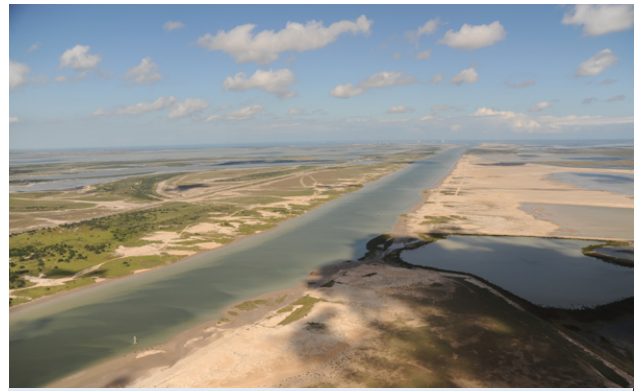
The 15 mile long Brownsville Ship Channel connects the Port of Brownsville in Texas with the Gulf of Mexico. Several leading green U.S. ship recycling companies operate along this stretch.

It is clear that the domestic ship recycling facilities are beginning to see increased volumes, particularly now that export is off the table and the Suisun Bay fleet is being scrapped as part of the settlement in the NRDC lawsuit and the poor condition those ships are generally in. However, unless the Obama Administration enforces its “ Lead by Example ” mandate under the October 2009 Executive Order 13514 and the Navy and MARAD review their policies, and account for all externalities, ocean dumping via reefing and SINKEX could gain traction and divert many ships to the ocean bottom that could be recycled domestically.