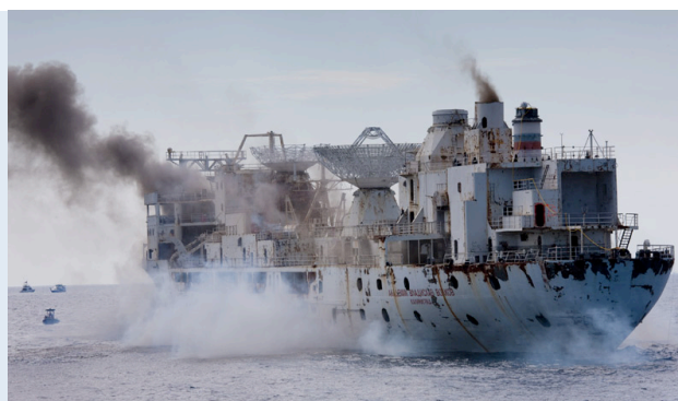
The Ex-Vandenberg was sunk in the Florida Keys National Marine Sanctuary in 2009 at a cost of $8.6 million. The vessel is a popular fishing destination as it is said to attract fish away from the protection of natural coral reefs within the marine sanctuary itself. However, it is well known that fish aggregation at a marked site can exacerbate the problem of overfishing, as concentrated fish populations can be easily and more rapidly harvested.