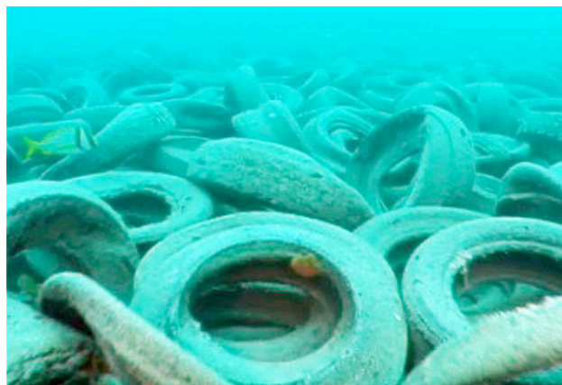
The Osborne Reef off the coast of Ft. Lauderdale, Florida is comprised of 2 million tires intentionally sunk in 1972. In 2007, U.S. military forces began clean-up of this environmental disaster, however clean-up efforts have only removed a reported 73,000 tires to date.

Sunken naval vessels are much like tires and subway cars. They are merely a solid waste material that is being disposed of on the ocean floor with artificial reef being the justification. However, the ocean floor may not be the final resting place of these waste materials, as future