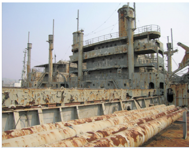
Obsolete vessels at the Suisun Bay Reserve Fleet in Northern California will either be recycled or sunk via SINKEX or artificial reefing by 2017. While MARAD acknowledges that more than 21 tons of lead, zinc, barium, copper and other toxic materials have been deposited in the bay from the deteriorating fleet, it remains unclear just how many tons of toxic materials above “trace contaminant” levels are deposited on the sea floor when vessels are sunk.

Consistent with these parameters governing placement, Article 4 of the Convention prohibits the dumping of all materials specified in Annex I, otherwise known as the black list. This list was created due to the strong likelihood that these contaminants create hazards to human health, living resources and marine life due to their hazardous characteristics. These characteristics include not only toxicity, but the