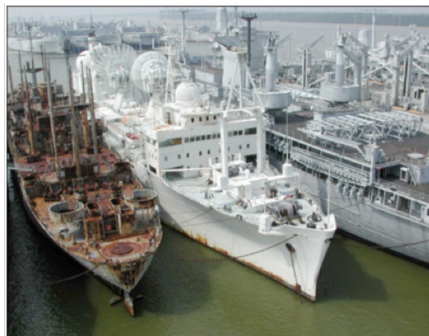
Rapidly deteriorating vessels awaiting disposal at the James River Reserve Fleet in Virginia

These vessels are merely transferred to NDRF locations on a custodial basis in accordance with the Economy Act of 1932 for berthing, maintenance and preservation; the Navy, however, retains title, and therefore disposal responsibility remains with the Navy for all combatant vessels.