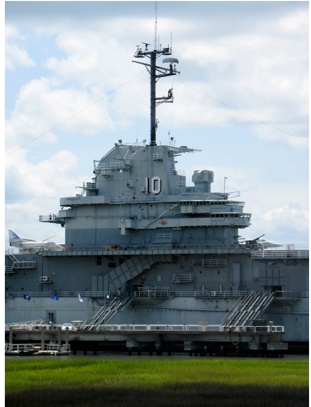
The USS YORKTOWN at Patriots Point, South Carolina

costs to state and non-profit programs. Vessel donations continue to be a low volume option for the Navy.