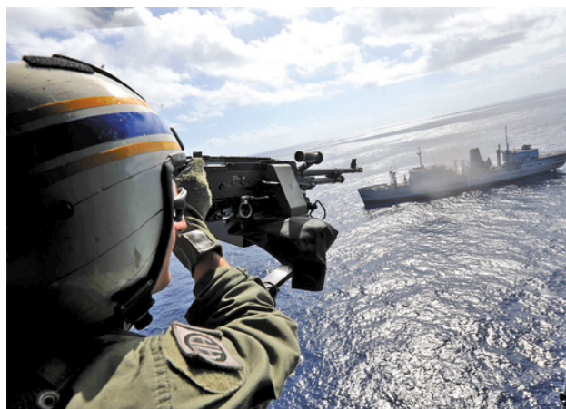
Helicopter machine gunner fires .50 caliber rounds on the USNS SATURN target as part of a SINKEK training event off the Atlantic coast. The sinking of this 10,205 ton vessel was exempt from TSCA.

As mentioned above, the EPA Administrator authorized an exemption from TSCA for SINKEK by transferring authority under section 9 of TSCA to MPRSA. According to the EPA’s position above, this transfer of authority should for the very same reason not be permitted.