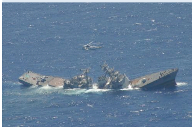
Ex-John Young, a Spruance Class Destroyer sunk in 2004 via SINKEX

The 25 vessels dumped contained approximately 156,000 tons of recyclable metals, including steel, aluminum and copper amongst others. In today's market, this material would be worth an estimated $155 million and over 1,600 U.S. green recycling jobs, each job lasting approximately one year. The sinking of the Radford will contribute another $6 million of recyclable material to the depths of the sea, and forfeit nearly 228 jobs from the economy at large, in a time when U.S. jobs are scarce at best.