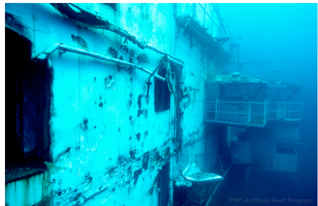
As the sunken Ex-USS ORISKANY deteriorates on the ocean floor, PCBs are leaching from the vessel and are being taken up by fish at the reef site.

It's important to note that the Delaware Artificial Reef Program states "gamefish such as bluefish, striped bass and weakfish are attracted to baitfish, which congregate around reef structures." 38 In effect, the gamefish that anglers are seeking to catch at the artificial reef sites, are in fact not advisable for human consumption due to PCB contamination.