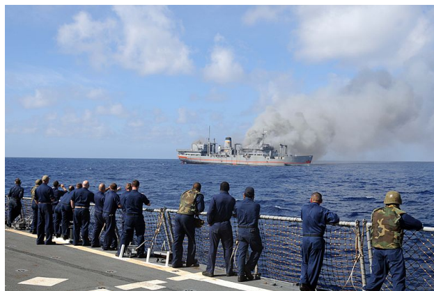
The crew of the GEORGE H.W. BUSH Carrier Strike Group looks on as the USNS SATURN is sunk in October 2010 as part of a SINKEX training event off the Atlantic coast. The 10,205 ton vessel was built in 1965, and likely contained PCBs above trace contaminant levels during sinking.

As discussed later in this report, the general permit which authorizes ocean dumping under SINKEX, should be revoked based on post-sinking monitoring studies that have now revealed elevated PCB leach rates from sunken vessels that are detrimental to human health and the environment. See Human Health Risk section for recent results from the sunken Ex-ORISKANY.