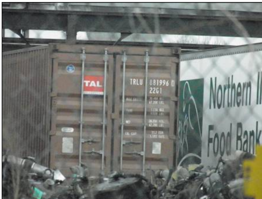
Attachment 2: Medium shot of container numbered TRLU 8819960, taken on March 10, 2011 from same location as Attachment 1 photo.