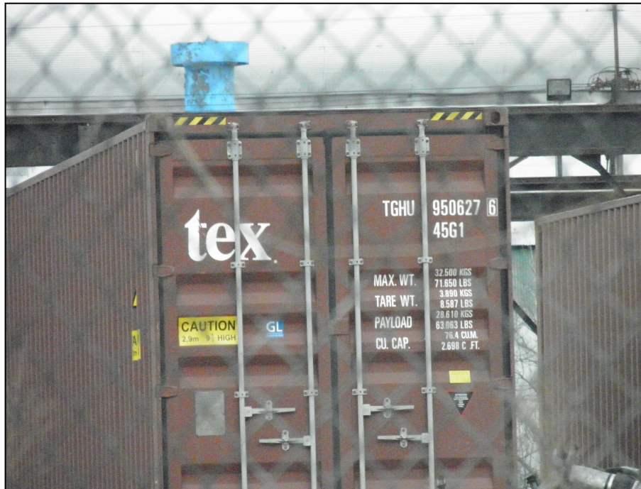
Attachment 3: Medium shot of container numbered TGHU9506276, taken on March 10, 2011 from same location as Attachment 1 photo.