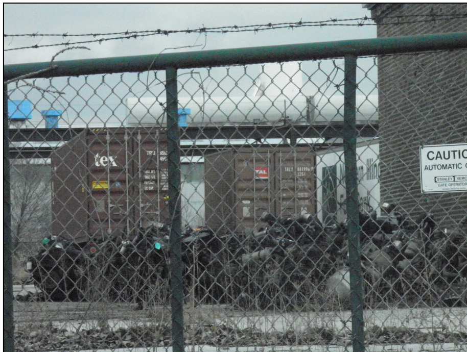
Attachment 1: Context photo of two containers, placing the containers at Intercon Solutions on March 10, 2011.