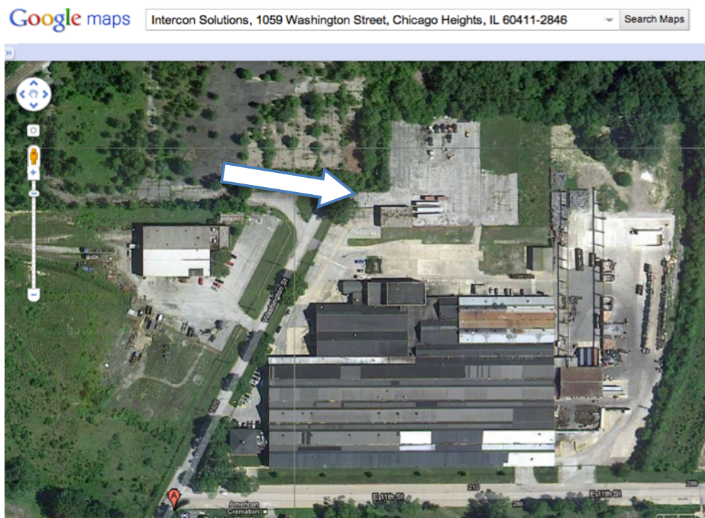
Attachment 4: Google Maps satellite photo with arrow showing vantage angle of above photographs.